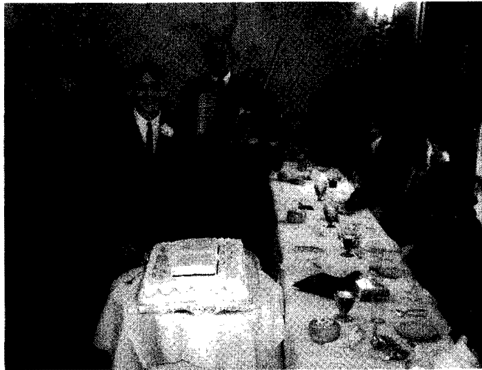
My Bar Mitzvah: March 4, 1961, "Today I am a man."

There's a real simple way to look at gender: Once upon a time, someone drew a line in the sands of a culture and proclaimed with great self-importance, "On this side, you are a man; on the other side, you are a woman." It's time for the winds of change to blow that line away. Simple.