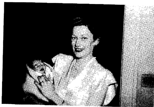
My mother was so proud to have given birth to a son. Today, our friendship is more than either mother-son or mother-daughter.