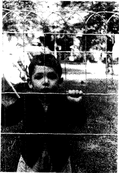
In the backyard of our house on the Jersey Shore. I'm about four years old.